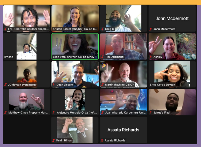
A Construction Co-op U class in October.

Staff and supporters at City Hall after speaking at a City Council Budget Committee meeting.