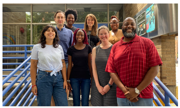
Staff members after a strategic planning session.

Mondragon serves as a guiding light and a proven